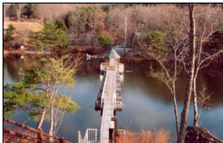
Lake Behind Government Hotel