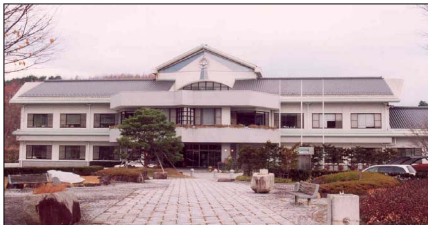
Iitate Town Hall