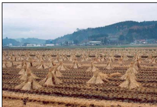
Rice fields in Iitate

During our stay in Iitate and Awano, we were introduced to a diverse agriculture sector. Iitate is a small town with industrial areas and small farm plots. It is located 450 metres above sea level. Due to the town's high elevation, and cold weather, it was only able to recover 1/3 of its crop. The main agricultural product of the area is rice, accumulating 1.2 billion yen per year. Other agricultural areas focus on tobacco and cattle. Production of vegetables and flowers are minor.