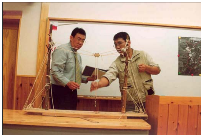
Prefecture Centre of Forestry

In Awano, 85% of the township is forested. Forestry is the number one industry with the harvesting of red cedar. To support this, there is the Prefecture Centre of Forestry. This centre has three instructors who work for the prefecture government office. They are affiliated with local forestry offices. This facility was completed last year. This forestry centre consists of 263 hectares. The mountain in which the forestry centre is located is owned by the Awano local government. This facility trains youth who are working in forestry. There are ten people trained here every year. They learn how to operate machinery. Students who come to the centre have already worked for 3 years. They come here to improve their logging skills. Local primary and high school students also come here to make some wood products.