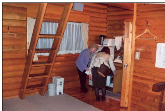
Urban - Rural Exchange Resort - Awano

Awano also offers a solid foundation of services to enhance local quality of life, as well as provide opportunities for urban - rural exchanges. First, we visited a resort was constructed, using local red cedar, to promote urban - rural exchanges. In Japan, the urban - rural exchange initiative began in 1975. In 1977, a resort was completed at this location. However, in May 2002, a new resort was completed to replace the old one. It has wheel chair access. While they do not offer government rates, it costs just 5,000 yen per night for eight people to rent a cabin. We also learned that an urban farming community and exchange hall will be built in Awano soon.