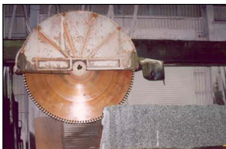
Saw Teeth with Artificial Diamonds