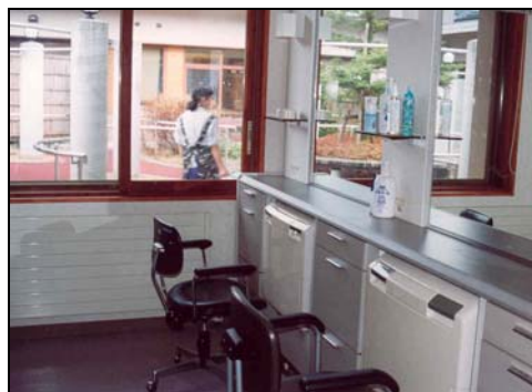
Sr. Care Facility - Hair Salon

In Awano, both Japanese and Canadian delegates recognized they face the same problem with doctor shortages in small towns. There is a perception that doctors in Japan only want to practice in urban areas. In Tochigi, there is a medical school subsidized by the central government to train doctors in rural areas. Similar medical schools are emerging at the University of Northern B.C. and in Nova Scotia. Nova Scotia also has a nurse practitioner program. These nurses can perform 90% of what a general practitioner would do, and then refer patients to a practitioner. There are two doctors in Awano, and they can refer patients to larger centres. There is a public health centre in Awano where residents can go for check ups. This centre focuses upon prevention programs. At this public health centre, residents can access an x-ray machine and blood tests. A mobile vehicle for CT scans also comes. There are two ambulances in Awano.