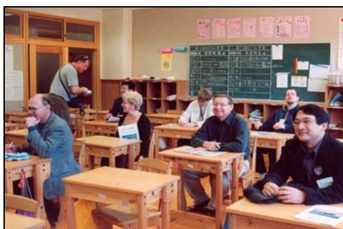
High School Classroom - Awano

Key features of the high school included a gymnasium and an outdoor swimming pool. More than 2,000 trees were used just for the beams. The gymnasium is 32 metres long. It is open for community use as well. The school was completed in September 2002. This school replaced four smaller schools. It is estimated that the school cost $39,812,000 Canadian. They received 850,898,000 yen in national funding. 1,021,500,000 yen was received from the local government board. 1,166,292,000 yen was raised from 16 or 17 years of savings from the Awano town reserve fund. Local taxes provided 146,297,000 yen. The total cost of the school was 3,184,987,000 yen.