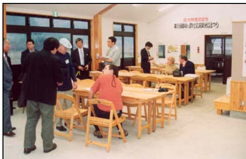
Meeting room inside Farmer's Market