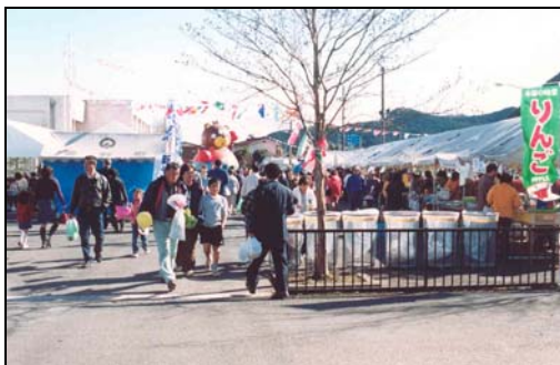
Awano Town Festival

Next, we visited the Hometown Autumn Festival. It is held twice a year. The other festival occurs in the summer. It started twenty years ago to unite the town of Awano. When it began, it was organized by a youth forestry organization. During this festival, they perform a traditional tea ceremony. There are 15 restaurants in Awano. They also have one mini golf course and four 18-hole golf courses.