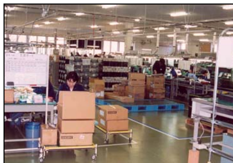
Tsukiden Factory Floor

At this factory, materials are heated up to 150°C before processing. All of the equipment is raised off the floor to cope with earthquake tremors. Sometimes they cooperate with other local factories to produce products to make other products. However, for the most part, customers want to keep their technology a secret, which limits cooperation with other local companies.