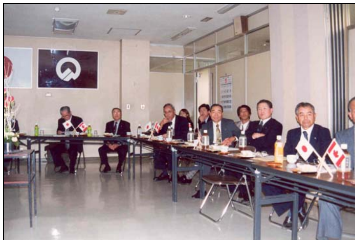
Meeting with Representatives of Awano's Local Government

leaving 60% without access to sewage. Houses were built along the stream, making it difficult to develop a sewage system. For the residents without sewage, each house has a filter and a tank. Water from the toilette is not collected, but tracked and treated at a facility. In Awano, we also learned that during the last elections, there was a 50% voter turnout for urban areas, whereas there was a 75% voter turnout for rural areas.