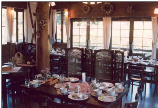
Interior of Italian / Japanese Restaurant

We also visited chrysanthemum greenhouses. These flowers are cut 3.5 times each year. It takes roughly 100 days for the flowers to emerge. After the flowers are cut, they are sent to the Japan Agricultural Flowers Association. They earn approximately 14-15 million yen in sales each year. These flowers are sent to Tokyo and Fukushima City. One bouquet costs 1,000 yen if you buy it at a floral shop.