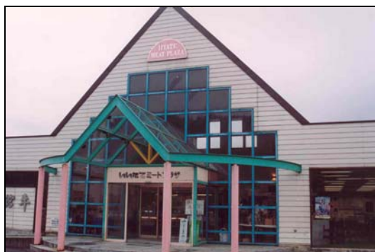
Meat Plaza - Iitate Agri. Co-op

In both Iitate and Awano, we saw innovative services that are able to capitalize on partnerships, one-stop shops, or the use of technology to provide services that may not otherwise exist. The first innovative service we were introduced to was the Agricultural Co-operative in Iitate, Fukushima Prefecture. Today, the Agricultural Co-op in the region has 17,200 members. The Agricultural Co-op also has 4,312 non farmer members. These are people who want to use the cooperative facilities and pay a share, but they do not have a voting right. These may be insurance providers, for example.