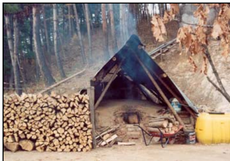
Traditional Oven - Iitate

Iitate has 3,000 cattle, including 500 for husbandry and 2,500 to be sold to the market for meat. Iitate beef is marketed in Iitate, Fukushima City, and neighbouring cities. We visited a feed lot which buys cattle from breeders that are later sold for slaughter. Mr. Takeshi noted that this revitalization centre was established in 1998. It provides research on agriculture. This facility has more than 300 cattle. In 2002, they sold 198 cattle. As a result of the mad cow disease that occurred in Japan some years ago, the price of cattle dropped. However, these prices are now recovering.