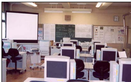
Primary Classroom - Iitate

There was also a primary school in Iitate that was 130 years old. Children are bussed in from as far as six kilometers away. Out of 191 students, 75 students take the bus and 12 bicycle to school. 103 students walk to school. There are 14 employees at this school, including the principal. The school promotes three principles. First, students improve their basic knowledge and learning skills. Second, students join in activities for planting and harvesting their own products. Finally, students are taught the importance of volunteer work in Iitate. The school year is 206 days long. School gets out at 2:30 p.m. each day. People from the school board come to talk to the students about not smoking, but the focus is not on crime prevention as crime rates are so low. However, the principal also showed us an alarm that is shaped like an egg that is attached to a chain the students wear around their neck. If someone suspicious approaches them, all they have to do is pull the egg and a very loud alarm sounds. The alarm costs 400 yen and lasts roughly a school year. These school alarms belong to the prefecture government. Each participant was provided with one of these alarms later on.