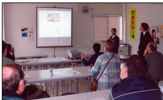
Meeting at Tsukiden Factory

ATMs. They also test all their equipment. This company has demonstrated its ability to diversify the products that it produces in a changing, global environment.