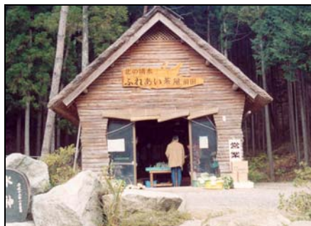
Farmer's Market - Iitate