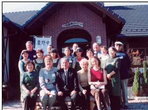
Italian / Japanese Restaurant

behind the restaurant. The pasta they serve is made from whole wheat from Canada! We were later informed that this restaurant received some logistical support from the Organization for Urban Rural Revitalization (OUR), which is based in Tokyo, demonstrating the effectiveness of bridging social capital and using networks.