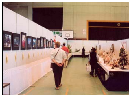
Awano Festival Arts and Crafts Fair

A theme of great interest became the differences in wages between men and women, as well as between those living in urban versus rural areas. This was difficult to decipher. Canadian delegates asked Awano representatives to compare the cost of living and wages in Awano to Tokyo. Those who work for big industry receive the same wages as those working in Tokyo. Others get about 85% of what individuals make in Tokyo. Electricity and vehicles cost the same