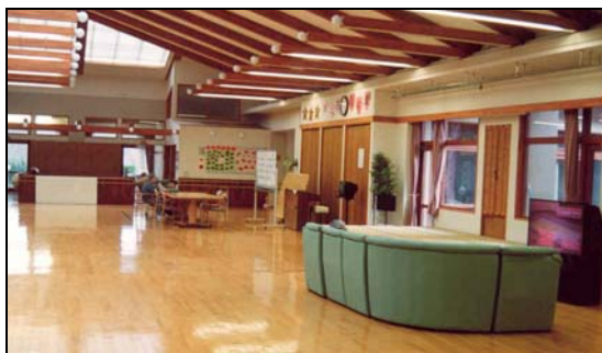
Common Living Area - Senior Care

This was an impressive facility equipped with a range of services including a fitness centre and a hair salon. The hair salon is operated on a volunteer basis for seniors. Hydrotherapy is available for seniors with disabilities. Ninety percent of the care is paid for by insurance and 10% is paid for by the patient. Fifty thousand yen per month must be paid by the individual. All expenses, except any medical care, are included. A pensioner in Japan collects 60,000 yen per month. Terminal care is also provided here, except for any major medical procedures. A medical clinic