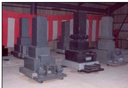
Grave Stones – Granite Factory

This is a joint government venture. There are ten investors. The government owns a portion of this operation because it processes a natural resource.