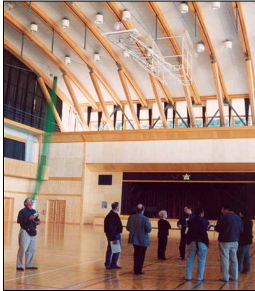
High School Gymnasium - Awano