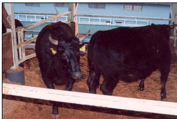
Centre for Livestock Technology

Iitate has 3,000 cattle, including 500 for husbandry and 2,500 to be sold to the market for meat. Iitate beef is marketed in Iitate, Fukushima City, and neighbouring cities. We visited a feed lot which buys cattle from breeders that are later sold for slaughter. Mr. Takeshi noted that this revitalization centre was established in 1998. It provides research on agriculture. This facility has more than 300 cattle. In 2002, they sold 198 cattle. As a result of the mad cow disease that occurred in Japan some years ago, the price of cattle dropped. However, these prices are now recovering.