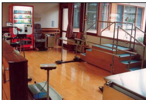
Sr. Care Facility - Fitness Room

Volunteers visit the home to dance and sing for the residents. High school students volunteer at the senior facility as part of their education. They must volunteer here five times per year for six hours each time they come to the centre. There are approximately 100 students participating in this program this year.