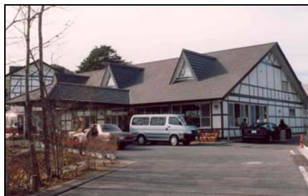
Government Hotel - Iitate

There are also two private hotels and one hotel that belongs to the local government. The Canadian delegation stayed at the hotel affiliated with the local government. At this hotel, there is a pond that belongs to the settlement for irrigation. The forest surrounding the area is a private forest. This hotel was built specifically to promote the exchange between cities and villages. There are plans to upgrade the facility and explore developing a hot spring here.