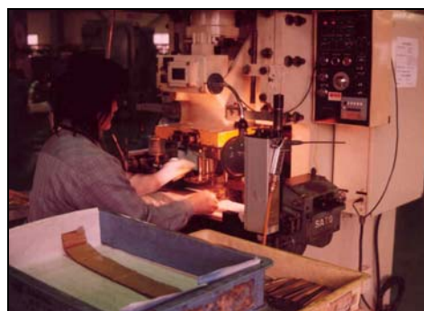
Factory Floor – Kikuchi Seisakusho

The Tsukiden Factory is another electronics company located in Iitate that has diversified its local products. This electronics factory was established in 1963 with initial capital of 48 million yen. The factory began by making coils for transistor radios. In 1987, the company expanded overseas to the Phillippines. They also have operations in Hong Kong. They have a partnership with NEC computer.