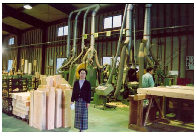
Lumber Mill - Awano

Second, we visited a local lumber mill operation. At this lumber mill, it takes five days to produce a house 165 m 2 . This includes two days to design the timber they need to produce and three days to process the lumber. Mostly local cypress and red cedar is used. This plant was built 11 years ago in 1992. There are seven people working here now. The lumber yard is a co-op with 17 members. One woman works here. However, more women could work here as everything is automated. They work 8:00 a.m. until 5:15 p.m. However, when it is busy, there are two shifts. The woman works part-time and earns 900 yen per hour. Men work full-time and earn 270,000 – 300,000 yen per month.