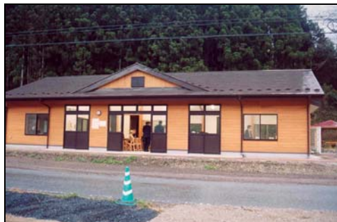
Farmer's Market – Awano