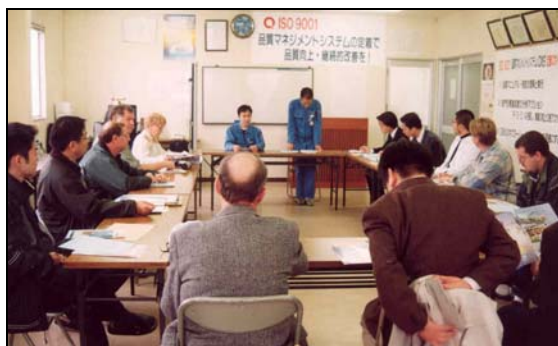
Meeting with Kikuchi Seisakusho