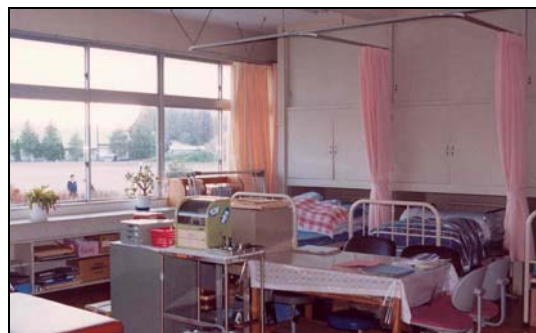
Primary School Sick Room - Iitate