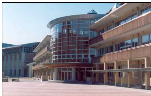
High School - Awano

In Awano, all of the Canadian participants were amazed with the educational facilities for a town of its size. We visited a high school for 404 students in Awano that used cypress to construct the floors and walls. There is a room for handicapped students with a shower room. Currently, there is only one handicapped student. Each room is equipped with wooden desks. The Board of Education has a meeting to discuss crime prevention. Before summer break, they tell students to be careful. However, there are no continuing programs throughout the year.