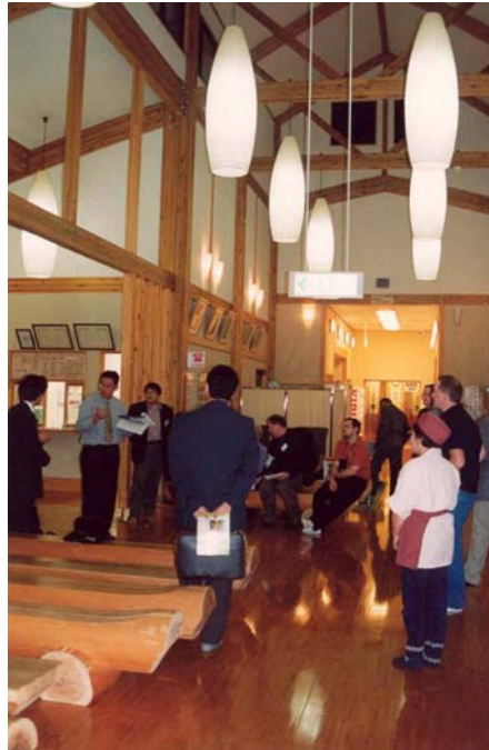
Hot Spa - Awano

We also visited a hot spa in Awano. Sulphur is pumped from underground from within a four kilometer range. They used local cedar for the construction of the facility. Customers come from around the prefecture, as well as from nearby prefectures. They receive roughly 400 customers per day. They use local products, including buckwheat noodles from the local farmer's market. This is another example of how local businesses are supporting each other.