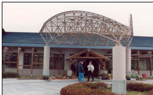
Senior Care Facility - Iitate

Consulting and counseling services are available all year. This senior care facility has 69 staff members. This facility cost 1.6 billion yen. The goal of this facility was to make it brighter by installing skylights throughout the building. They also tried to use as much wood as possible to create a feeling of warmth. This facility currently has 28 single rooms and 16 double rooms. This compares to other facilities which may accommodate up to four people per room. We saw 59 people at this facility today, of which 39 individuals are local citizens. Currently, there are 8,000 seniors on a waiting list for senior homes.